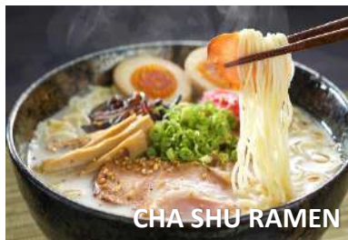
CHA SHU RAMEN