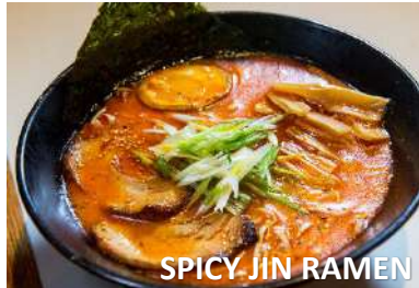
SPICY JIN RAMEN