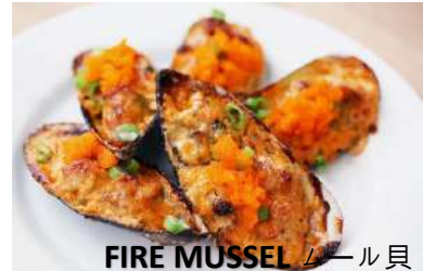
FIRE MUSSEL ムール貝