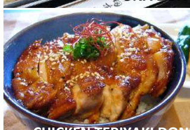
CHICKEN TERIYAKI DON