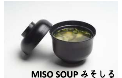
MISO SOUP みそしる