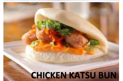
CHICKEN KATSU BUN