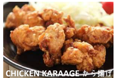
CHICKEN KARAAGE から揚げ

Tempura てんぷら Lightly Battered N Deep-Fried Shrimp, Vegetables 10.95